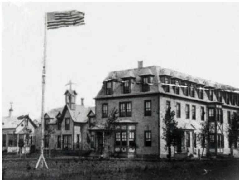
This Boarding school was closed in 1909 and handed to the State of Minnesota with the stipulation that all Native Americans at all times shall be admitted free of charge for tuition. This is a policy the school, now "University of Minnesota" still proudly honors. Morris, MN